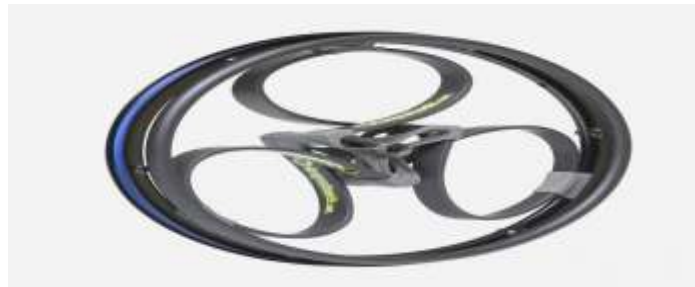
Fig. 1: Loop Wheel

A Loopwheel is a wheel with integral suspension, designed for better shock-absorbing performance and greater comfort. Loopwheels give you a smoother ride. They are more comfortable than standard wheels: the carbon springs absorb tiring vibration, as well as bumps and shocks. They're designed for everyday use and are strong and durable. The loopwheels for wheelchairs help people push over uneven streets, rough tracks and gravel paths, with less effort, and the carbon springs give you extra power to get up or down kerbs. They reduce jolting and vibration, by as much as two thirds compared with a spoked wheel. They made the decision to focus just on wheelchair wheels because the demand for these was really strong, and but it is very small company. A loopwheel for bikes is an awesome ride. As we know because we've tried them a lot.