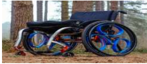
Fig.2 Loopwheel chair

The spring configuration allows the torque to be transferred smoothly between the hub and the rim. The spring rate for wheelchair wheels was specifically chosen. Being carefully developed and tested for this particular application. Every loopwheel within a product category has the same compression rate as another from the same category. We check this to assure constant manufacturing quality.